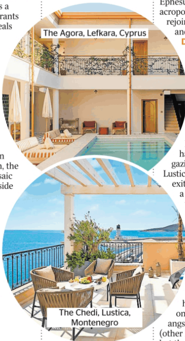
The Agora, Lefkara, Cyprus

Details Seven nights' B&B from £1,085pp, including flights, transfers, complimentary hammam and gulet boat excursion (simpsonstravel.com)